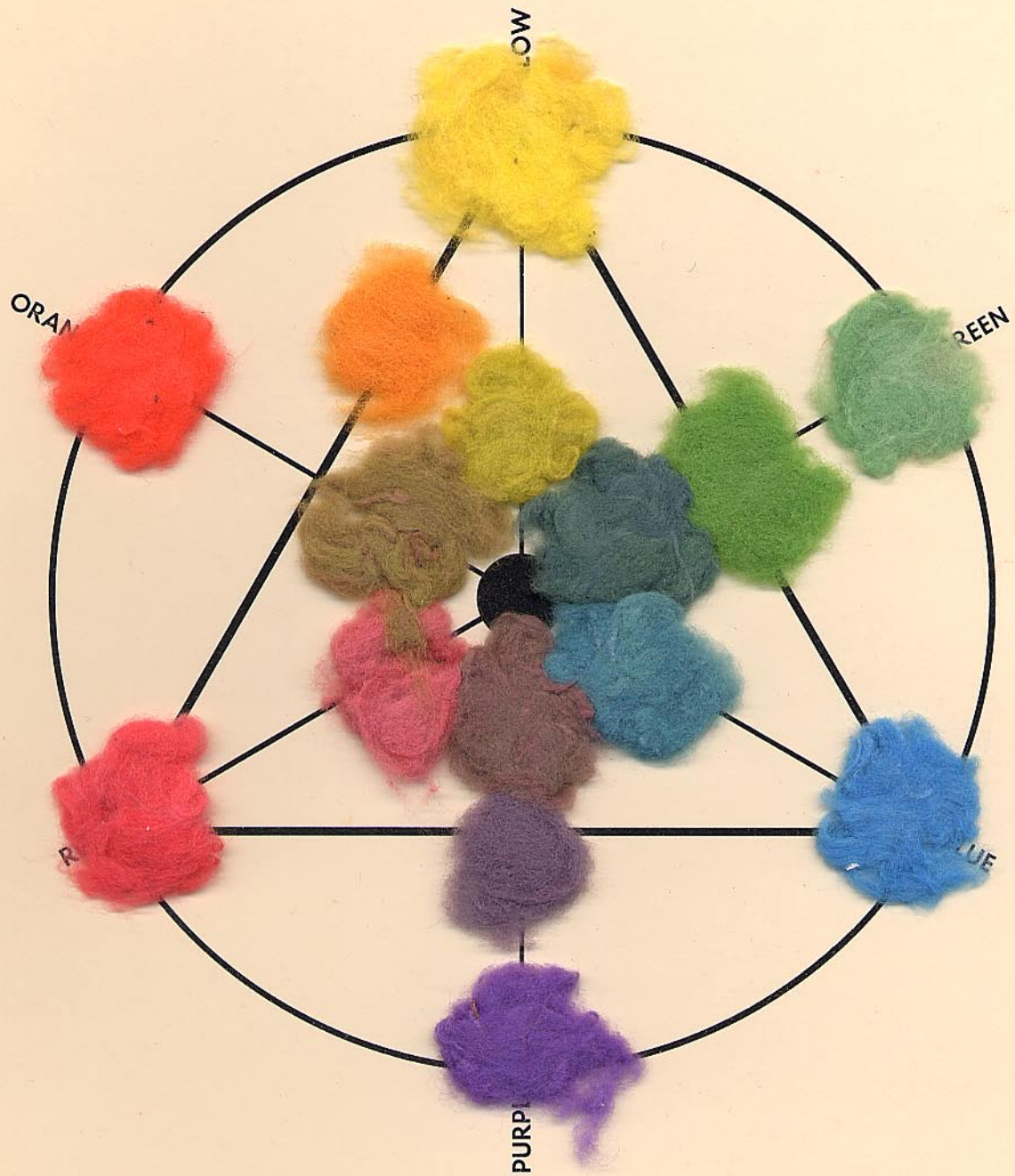
THE DYER'S COLOR WHEEL