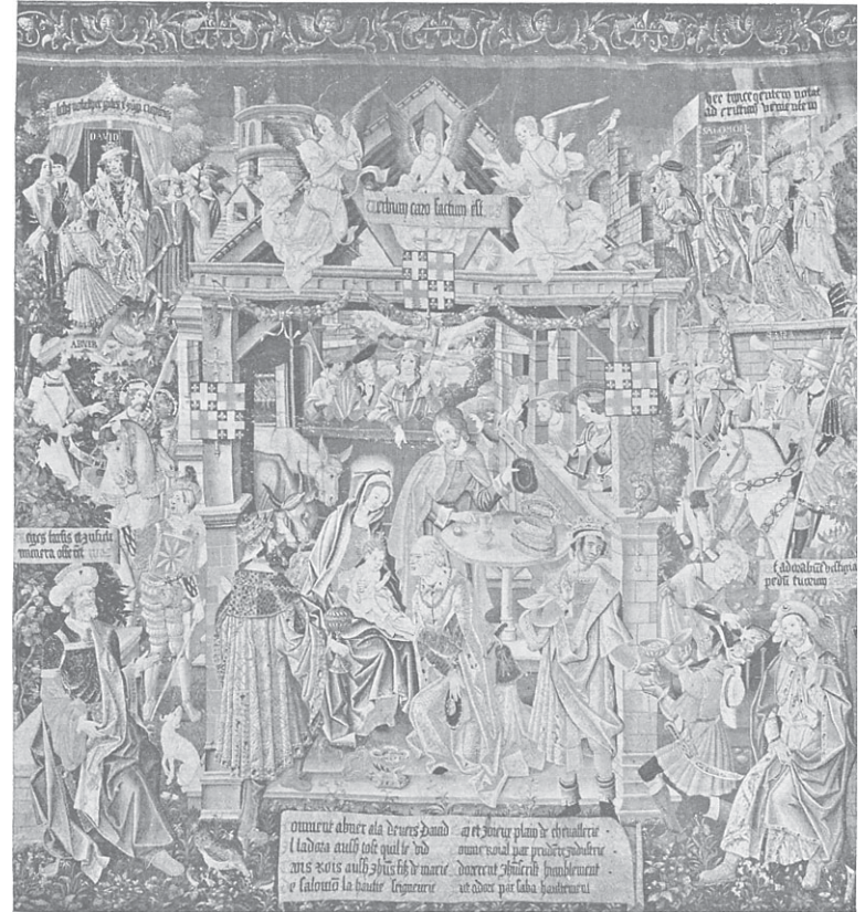
No 218. TAPESTRY. The Adoration of the Magi.