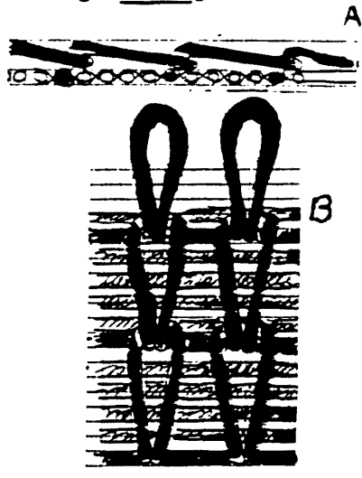
Figure No.2 New Way of Using Tufting Technique.