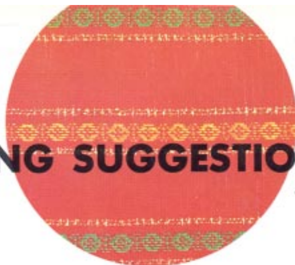
A Christmas Carol