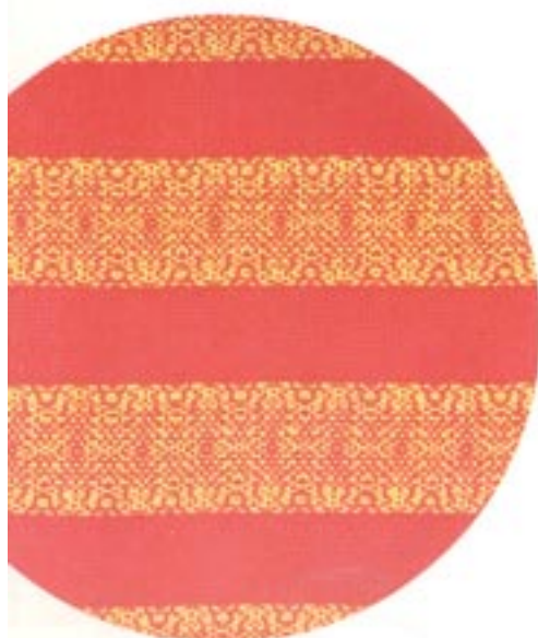
Song of India