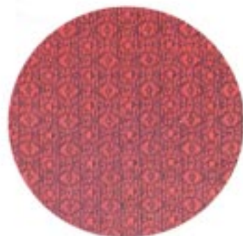
Gone Fishin' No. 1