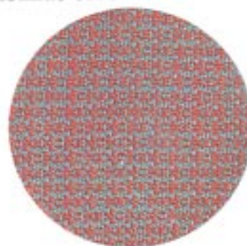
Gone Fishin' No. 4