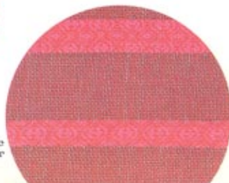
The Last Rose of Summer