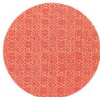
Gone Fishin' No. 2