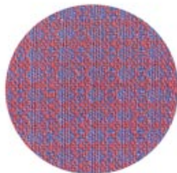
Gone Fishin' No. 3