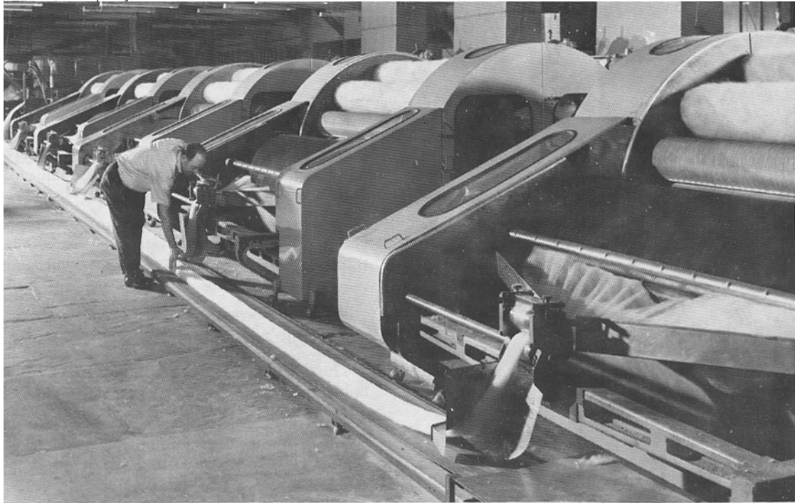
A SERIES OF PHOTOGRAPHS ON THE PRODUCTION OF WORSTED YARNS. As many of you know worsted yarns are wool fibers that have been combed parallel, short fibers removed, and then spun into a yarn. This results in greater strength, durability, and also these yarns quite often pick up a sheen. We will have one picture a month for 8 months. The first photograph here shows some of the most modern carding machines that are used to card wool. Here is what the manufacturer says. In scoured wool, the fibers are aggregated in tufts and have to be separated from one another before the wool can be combed. This separation is performed in the carding machine, which teazes out the fibers and also removes impurities such as burrs. In the bottom right hand corner of the picture the wool is seen being removed from the final doffer and gathered into a long even band called a sliver. This row of modern carding machines has an automatic conveyor belt for the slivers.

Because of this, Warp and Weft will now be $4.50 per year. We are keeping the increase in price to a minimum to just defray the increased costs that we have in getting it out to you.