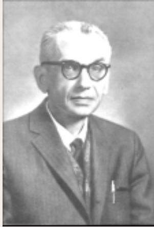
Kurt Gödel 1906 - 1978

Kurt Gödel shook the foundations of mathematics by proving that certain mathematical propositions cannot be proven to be true or false.