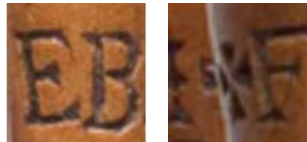
T.7-1944 Lace Bobbin (detail) English, c.1795 Wood, carved with figures

Firstly we see some attempt at using seraphs in the overall set of initials. This was quite a common approach in carving letters, both comprising a series of dots (East Midland) and straight carving of letters (East Devon/Downton) [general comments, of course there are exceptions]