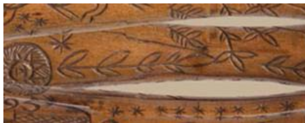
T.7-1944 Lace Bobbin (detail) English, c.1795 Wood, carved with figures

Of course I am being a bit fanciful now, but I see the big dipper (or little dipper) on the bobbin. Yes I know the numbers of stars on the ladle are not correct; but here is a shepherd out on the hills at night looking up to the sky and seeing that wonderful constellation. Here it is... please synchronize your imagination to mine!