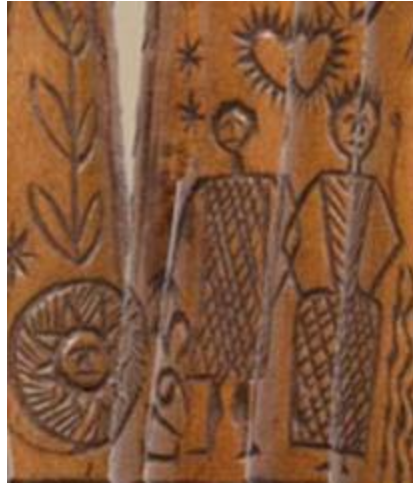
© Fitzwilliam Museum, Cambridge' T.7-1944 Lace Bobbin (detail) English, c.1795 Wood, carved with figures

Before I get on to the unique features of design on this bobbin I will look at three of the remaining that are in some ways repeatable on other bobbins.