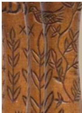
T.7-1944 Lace Bobbin (detail) English, c.1795 Wood, carved with figures

To save you going back to see the picture here again is a section of it. Yes, it has the bird in it but that will be the next design feature to talk about.