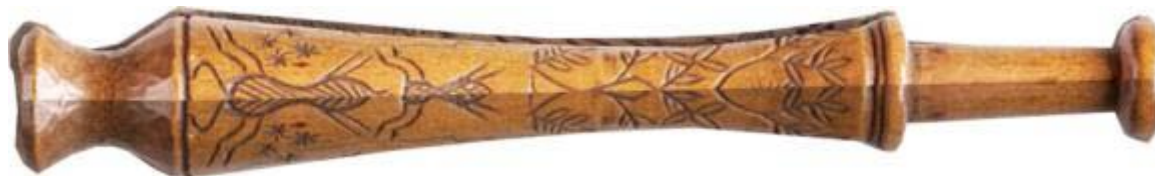
T.7-1944 Lace Bobbin (detail) English, c.1795 Wood, carved with figures

I experimented with cutting the image in half lengthways, flipping it and laying it (with a slight margin for demonstration purposes: see the top 2mm margin between the layers) to show a degree of cylindrical accuracy that I doubt would occur in a totally hand carved bobbin. I fully admit that I may well be wrong.