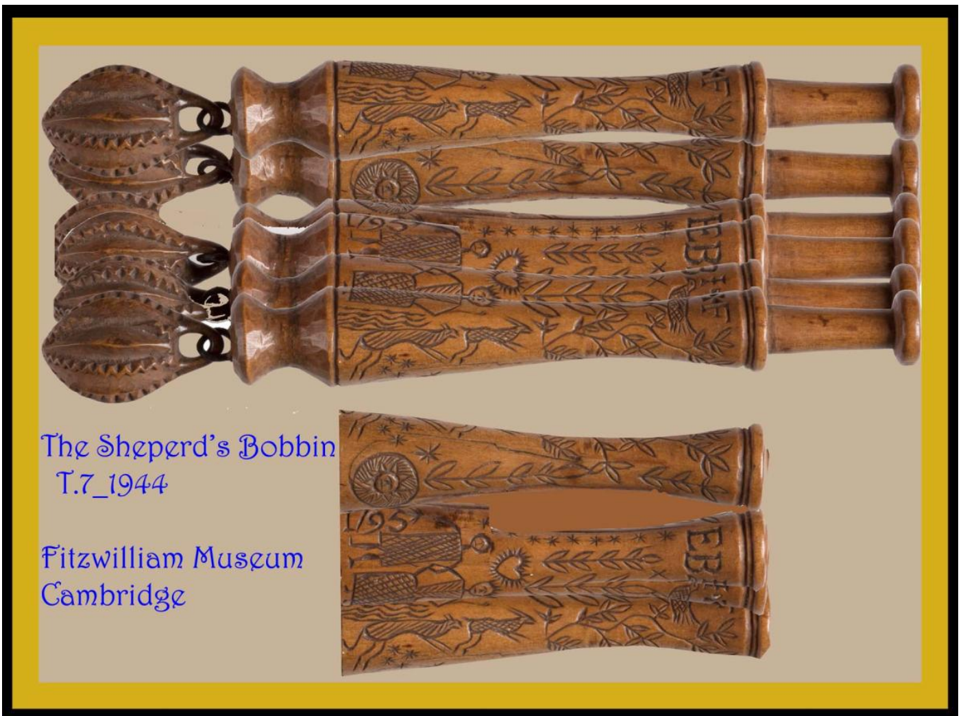
The Sheperd's Bobbin T.7_1944